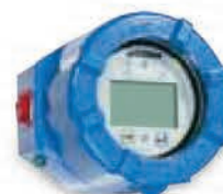
MTII-4300 Magnetostrictive Transmitter