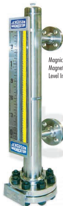
Magnicator® II Magnetic Liquid Level Indicator